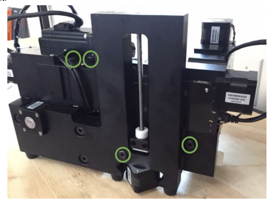
Figure 1: Pocket NC V2 Series all shipping bolt locations shown in green circles.

The shipping bolts are M6 shoulder bolts of three different lengths. The 4 mm hex key needed to remove the bolts is included in the toolkit shipped with the machine. The bolts are installed only hand-tight.